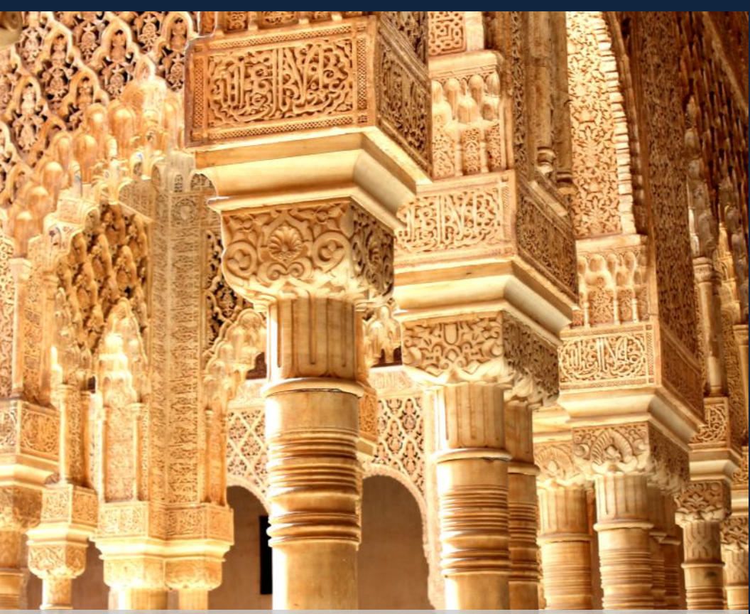
The Alhambra Palace, Granada, Spain

These interactive seminars are supplemented with additional readings and resources for personal study that are available online at iicanada.org.